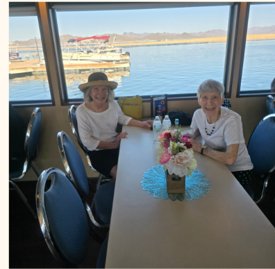
Fun times at the Lake Pleasant Brunch Cruise