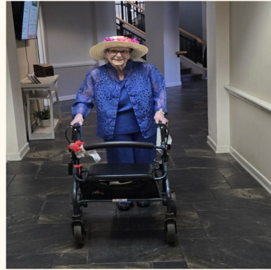
Ladies waiting to come to Our Ladies Tea.