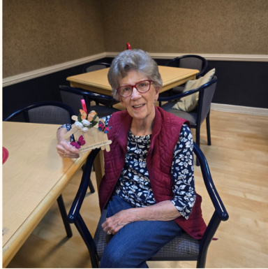
May Craft door hanger with positive quotes.