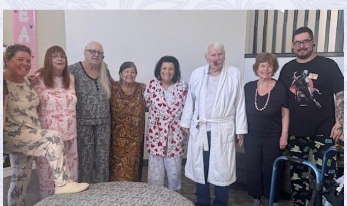
Pajama Day 2025!