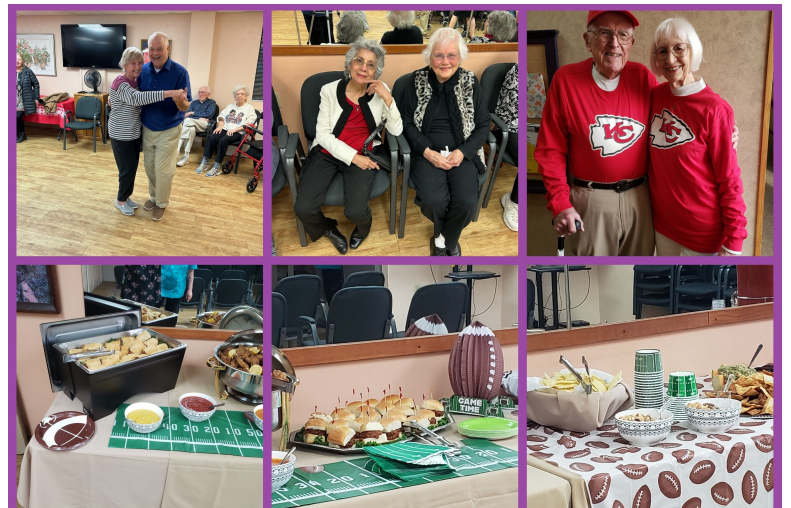
More February Fun - The Dance and Super Bowl Party