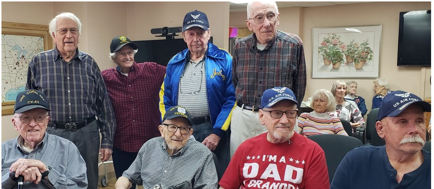
Some of our Veterans at the Veterans Day Program

Happy Holidays! Our entire staff would like to wish you and your family and friends a joyful holiday season and a wonderful New Year!