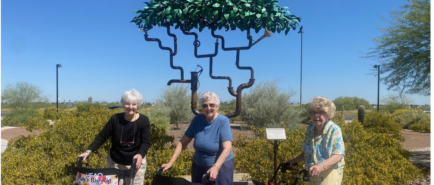
We had a wonderful experience at the West Valley Art Gallery, where we enjoyed viewing diverse artworks and taking a stroll through the garden on a beautiful day.