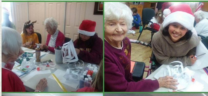
Crafts with the students from Sedona Charter School