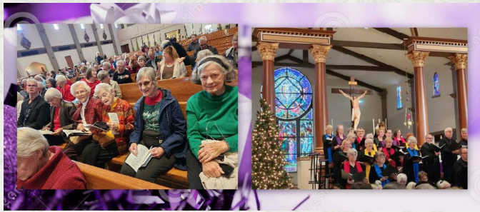
Residents enjoying the Verde Valley Voices Christmas Concert held at the Catholic Church

405 Jacks Canyon Rd • Sedona, AZ 86351 • (928) 284-1021