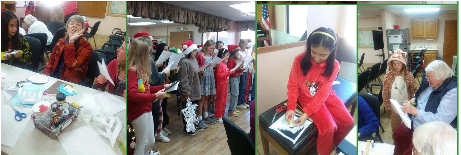
Students from the Sedona Charter School came caroling and then did a craft with the residents.