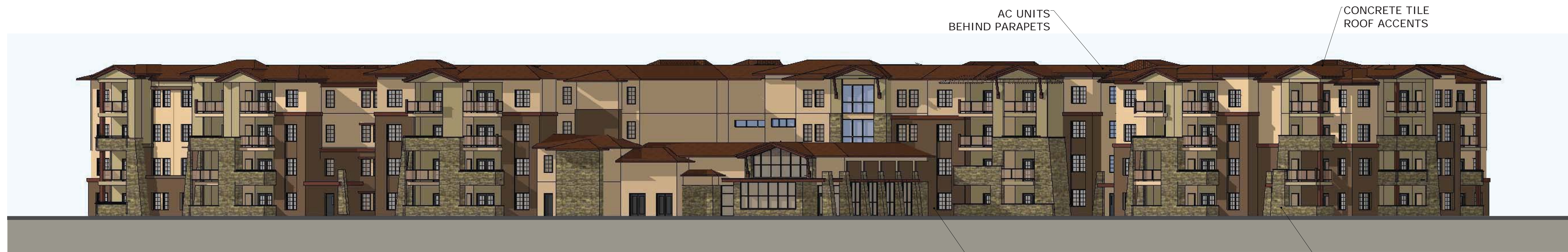
REAR / NORTH ELEVATION