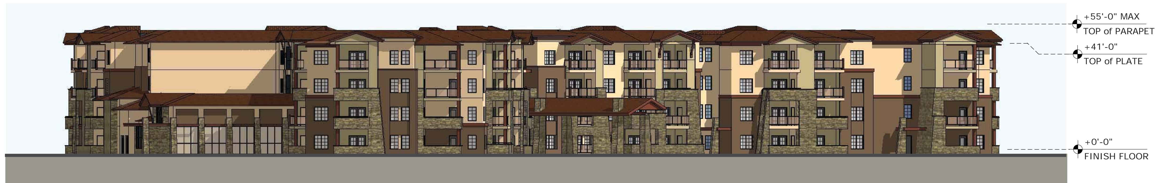
NORTHWEST / SIDE ELEVATION