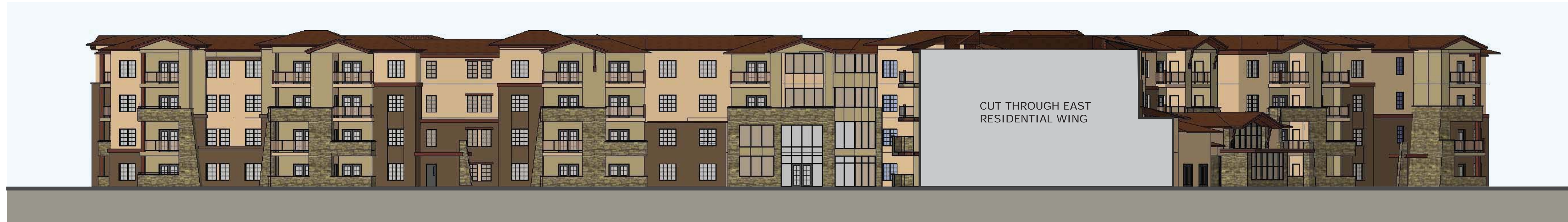
EAST / SIDE ELEVATION