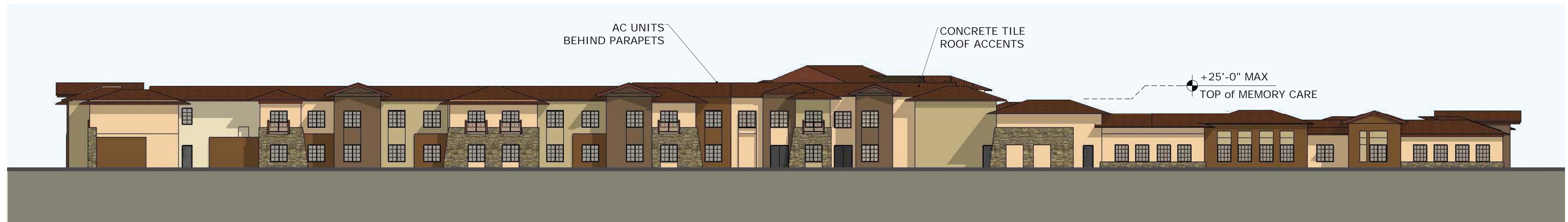
REAR / SOUTH ELEVATION