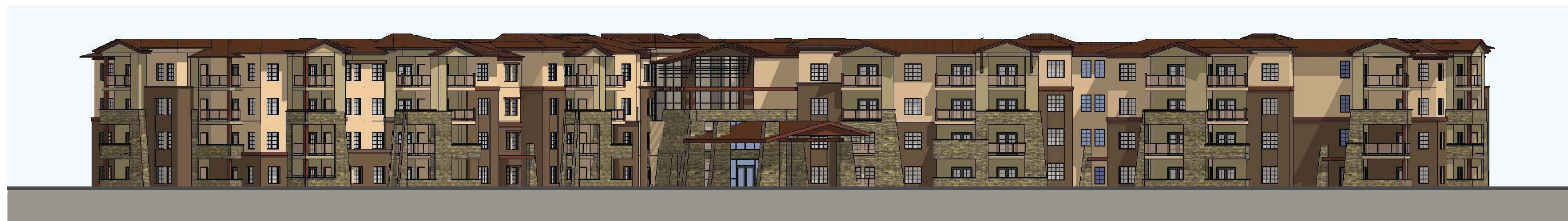
FRONT / WEST ELEVATION