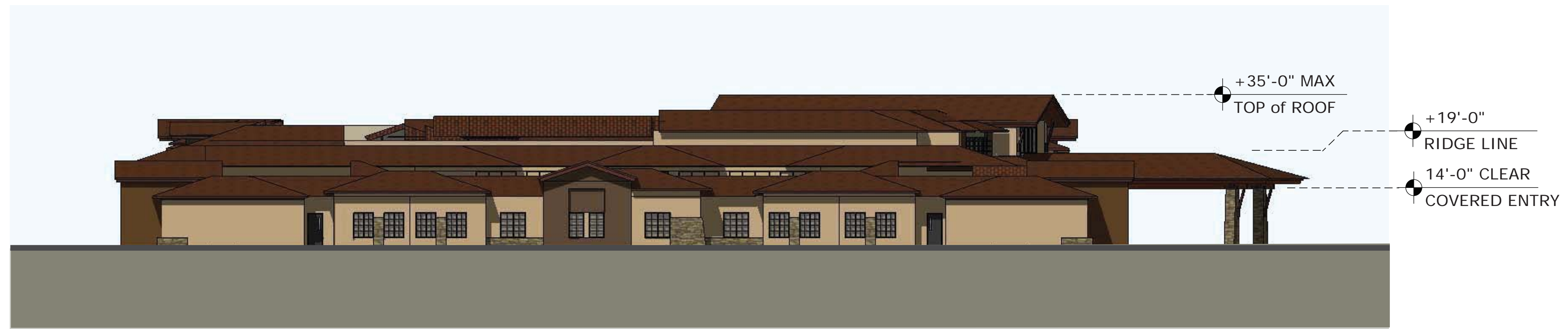
EAST / SIDE ELEVATION