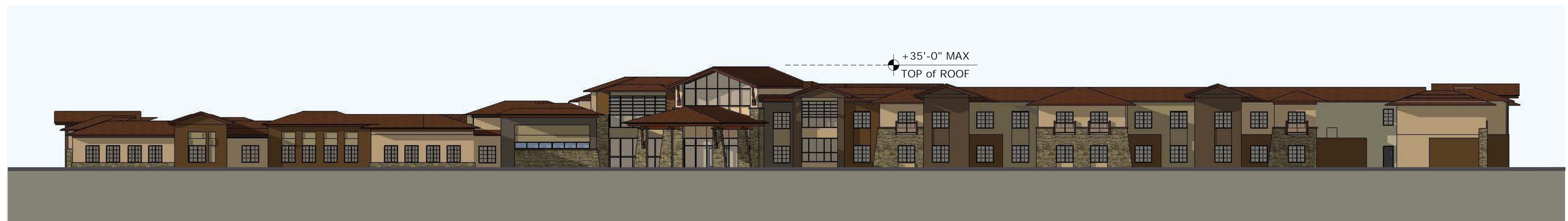
FRONT / NORTH ELEVATION